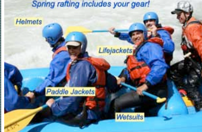
Spring Rafting on the NoFo!

Springtime trips require gear, so we include this with each rafting package that we offer. See the picture to the left for an example of what to wear. We include a farmer john wetsuit, splash jacket, helmet,