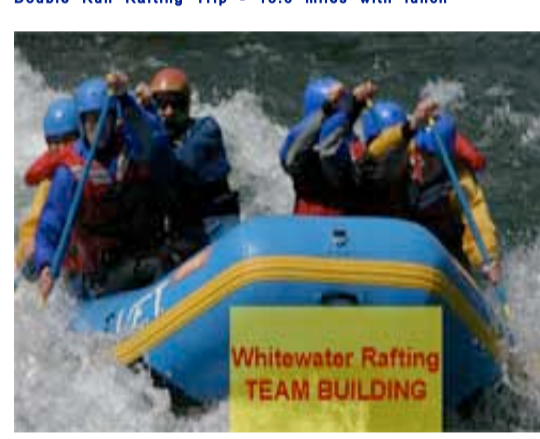
Double Run Rafting Trip - 18.6 miles with lunch

Run the river twice in one day! This package is ideal for the aggressive, athletic paddler who wants the ultimate challenge. Start times meet early in order to run the NoFo twice. The double run comes with a lunch served right after the first run. (Add $50/person to any one day discount price for a double run!)