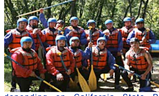
One Day River Trip - 9.3 miles with lunch

Class 4+ whitewater trip includes wetsuits, paddle jackets, helmets, lifejackets, lunch and guide service. We recommend experienced paddlers. Each raft holds 4 to 6 people plus the guide. Meeting time is usually 9:00 AM or 1:00 PM depending on California State Park lottery. Check the group picture on the left. Strong, hardy paddlers in excellent health are the best paddlers for this intense white water rafting trip. Min age is 16 yrs Discounts!